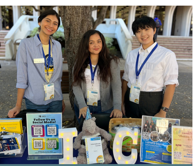
International Center staff tabling at Graduate Student Resource